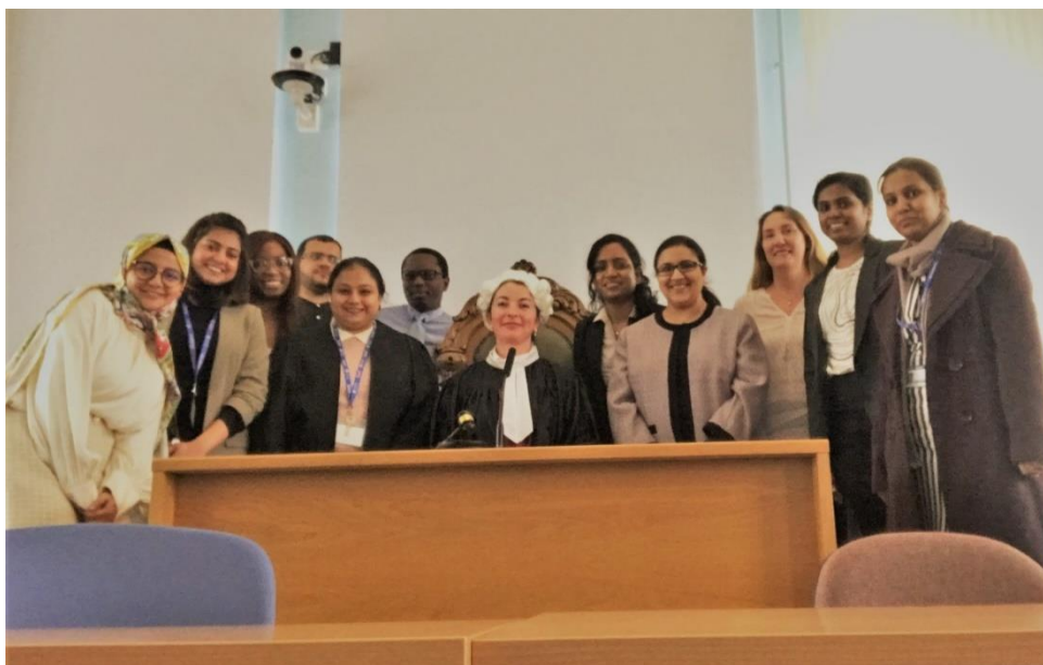
Figure 2 Mock Court Session.

Assessment will be done on a regular basis at various stages during the course. It will be based on written assignments, written reports for cases, practical examinations, conduct of the expert witness at mock trial, and research project.