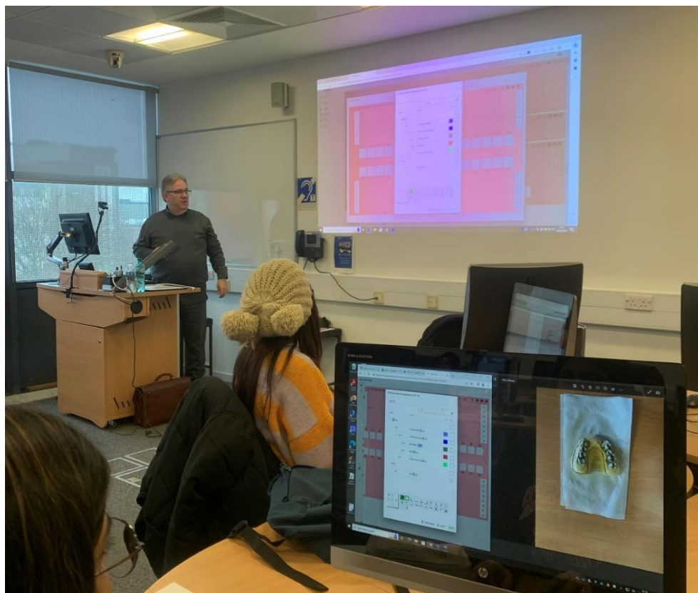
Figure 1 DVI Plassdata Training.

Studying alongside students in forensic medicine and law means that the students will gain an understanding of the role of other forensic disciplines and identify when, where, and how forensic dentistry links with the wider forensic community. University of Dundee encourages students to engage in research, providing a supportive environment for research in forensic dentistry. The MSc programme has a component of research and students will gain rich experience of research methods in forensic dentistry.