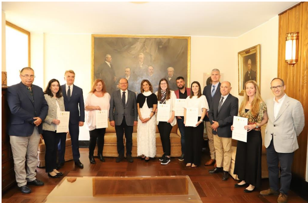
Figure 2 New Diplomates from the 1st Edition of the Specialization Course with the Academic Staff.