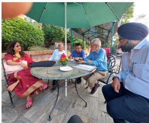
Figure 4 INPAFO General Body Meeting being held at pool side, hotel Godavari Village Resort, Kathmandu, Nepal.

the occasion. More than 95 delegates participated in this 3-day scientific extravaganza, with delegates from India, Nepal, Bhutan, the Maldives, Croatia, and Canada.