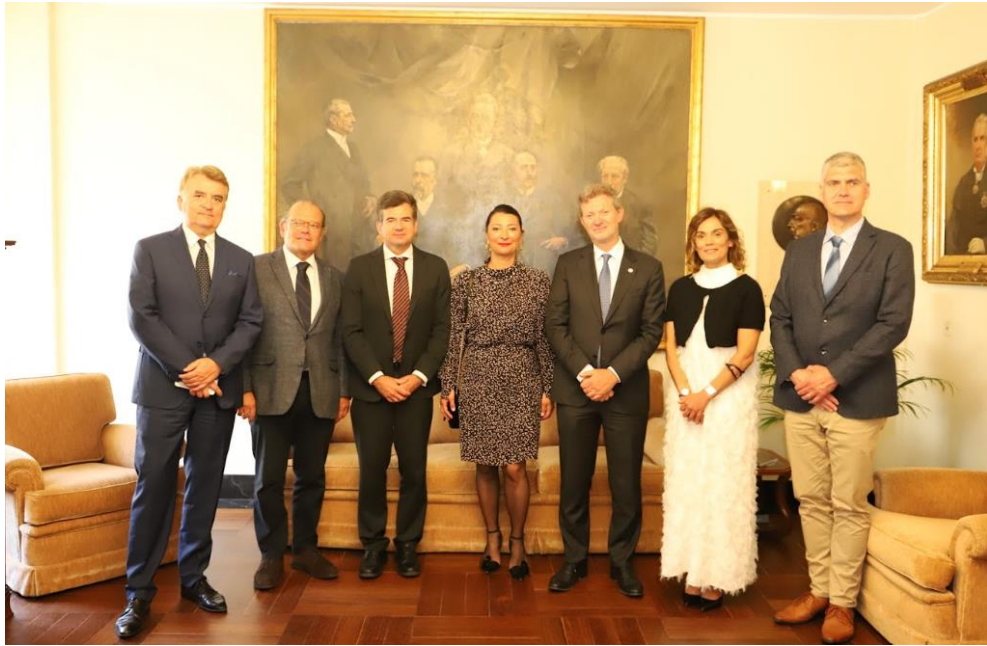
Figure 1 Supervisors and Members of the Scientific Committee of the Specialization Course on Forensic Odontology and the Deans of the Faculty of Dental Medicine and Medicine of University of Lisbon and of the Faculty of Dental Medicine of University of Zagreb.