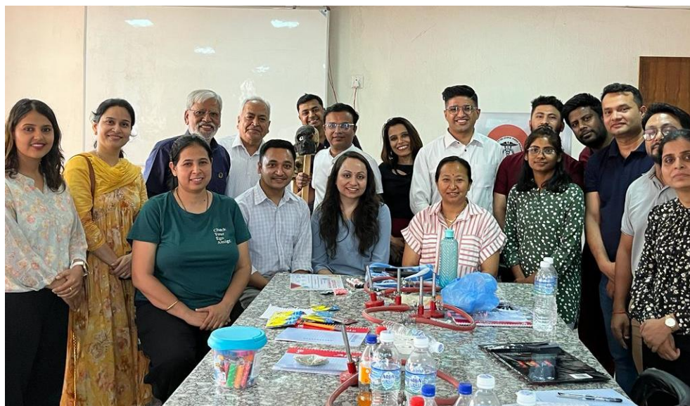
Figure 1 Course 2 (Forensic Facial Approximation Workshop) at Maharajganj Medical Campus, Kathmandu, Nepal.