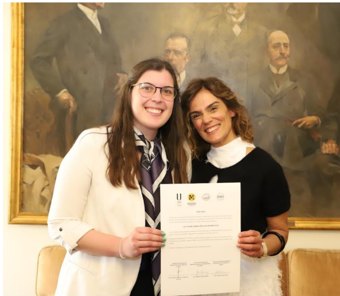
Figure 3 Diploma Ceremony 2021-2022 Postgraduate Specialization International Course on Forensic Odontology.

and anatomical theater. They could learn with the most important institutions related to the forensic world: criminal police and forensic institute.