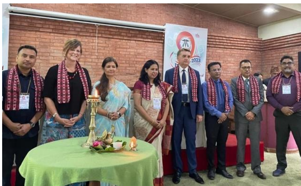
Figure 2 National and international dignitaries on stage at the inauguration function.

The main conference was held on the 10th and 11th June 2023, at the Hotel Godavari Village Resort, Kathmandu, Nepal. A fantastic stage was prepared for scientific presentations, award distribution, speeches, and cultural functions. Many international leaders and dignitaries were present on (Figure