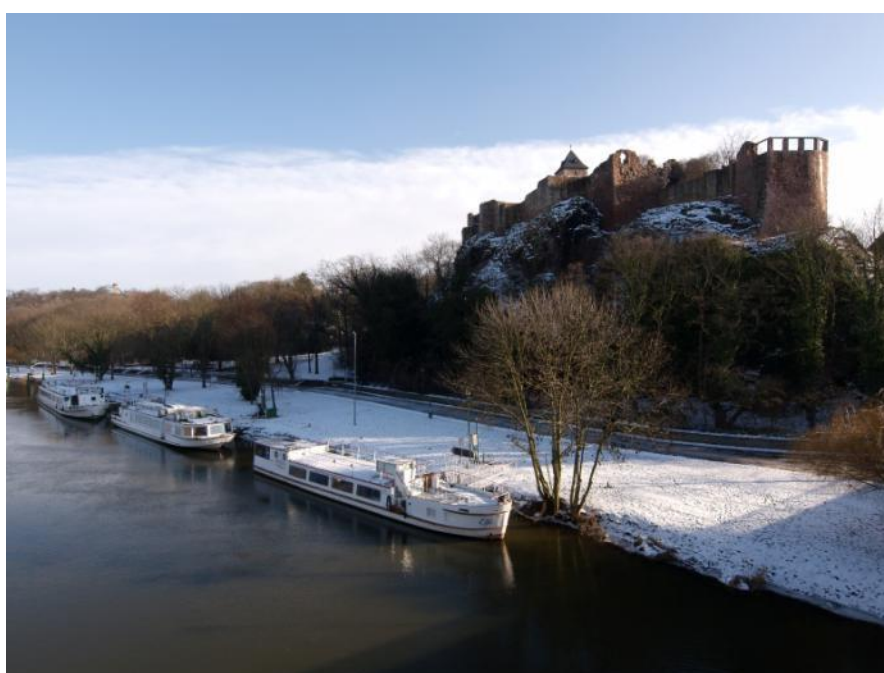
Halle (Saale), Germany