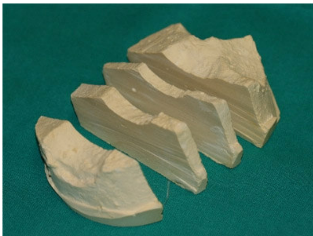
Fig 2: Sectioned cast showing bite profiles

It was then decided to replicate the polony model so that sections could be made through the bite mark at different heights (Fig 2). This produced clear bite mark profiles which could be compared to the models of the three suspects.