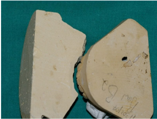
Fig 3: Suspect's dental impression matched to bite profile in polony cast.

A macroscopic and microscopic pattern association was now carried out and a match was established between the bite mark and suspect 2 (Fig 3).