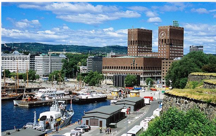
City Hall Harbour, Oslo, Norway

Place: Institute of Oral Biology, Domus Odontologica, Rikshospitalet, Gaustad, Oslo