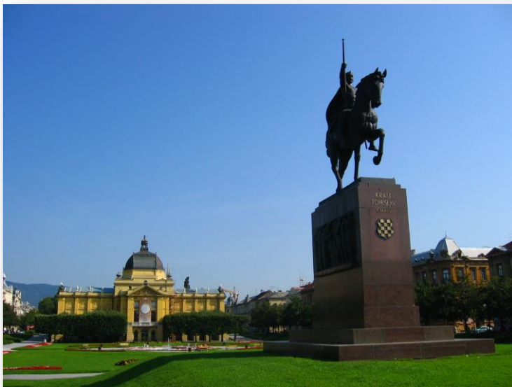
Landscape of Zagreb, King Tomislav square