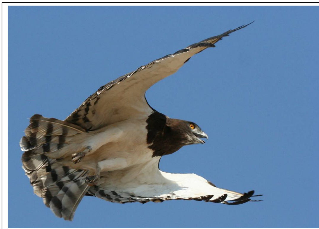
Blackchested Snake Eagle - Z Bernitz