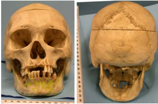
Fig.1: The anterior and posterior aspects of the skull; the extremity of the atlantic right posterior arch is indicated by the black arrow.

cut (Fig.3), and slotted into corresponding holes in the superior surface. On both sides of the cut, aligned holes indicated the position of clips for securing the vault. A single smaller hole, anteriorly on each side, indicated the position of a spring for securing the mandible. The conclusion is that at some time in the past the skull had been held in an anatomical training facility or in a medical practitioner's surgery.