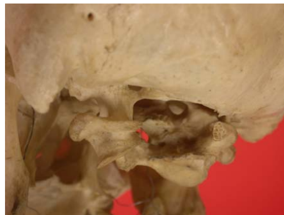
Fig.7: Left posterolateral aspect, showing the left fusion post and an end-on view of the honeycombed, scalloped, right posterior arch of the atlas.