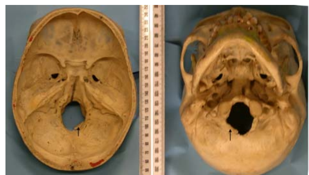
Fig.3: Intracranial and inferior views of the skull. Intrusion of the right atlantic posterior arch into the foramen magnum is indicated by the black arrows.

There appears to have been a marked overbite, particularly on the anterior teeth (Fig.1). There is marked dentine exposure on most of the occlusal surfaces and also interproximal attrition (Fig.2). Calculus is present. No carious lesions were observed on the remaining teeth. The 41, 42, and 43 teeth are misaligned. The roots of the 45 and 46 had been functioning as occlusal surfaces. On the buccal surface of the mandible is a bony reaction to an apical abscess of the proximal root of the 46 tooth (Fig.1).