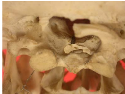
Fig.6: Posterior aspect of atlas and skull, in eccentric relationship, showing the odontoid articulation facet flanked by the inferior atlantic condyles.