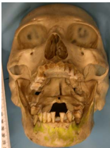
Fig.2: An open-mouth view, showing thinning of the orbital roof, the degree of occlusal wear, and indicating the centre of the atlantic anterior arch by an asterisk.

Subsequently, the mandible had been painted luminescent, lime green (Figs.1,2); there were red paint traces round the inferior cut surface of the cranium, and a single fleck of white paint above the larger of the two right supraorbital foramina - the 'holder' of these human remains claimed to have purchased them from a "travelling horror show" around 1986.