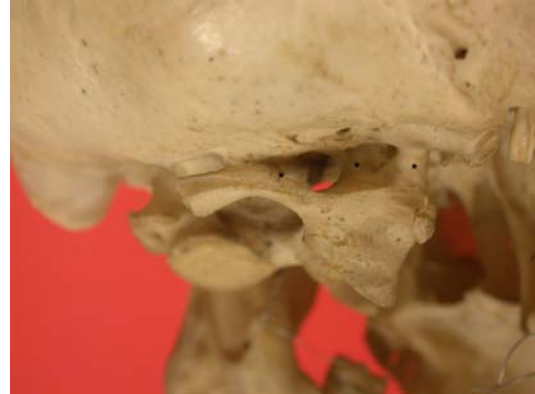
Fig.5: Right lateral aspect of the skull. The three sites of fusion of the atlas with the occiput are indicated by the black asterisks.

both Gladstone and Erichsen-Powell's 11 and Green's 7 findings. There is a marked exostosis at the site for articulation with the odontoid process of the second cervical vertebra (Fig.6).